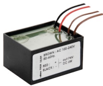
OPTIONAL Power supply

FA184 Power supply 16 x 1W/ 110÷240V - Iout 350mA (12x1W@110V) IP67 Class II Selv Dimmable Push-Dimm Or 1.10V